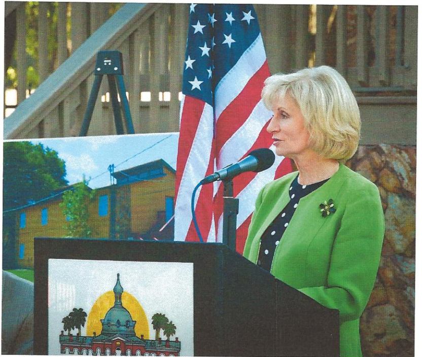
Commissioner Sandy Murman speaks at a recent ribbon-cutting and open house for Friendship Village on March 13.

Thousands of county kids are now safer. City and county workers have anchored down heavy soccer goals left unsecured. County Commissioner Sandy Murman stepped up with fast fixes for both the short- and long-terms. She asked county staff to survey its fields. Of 106 soccer goals, only 12 were secured. "I was completely alarmed," Murman said. "We're taking every step we can to make sure we're going to have a permanent solution in place and that we're following the guidelines."